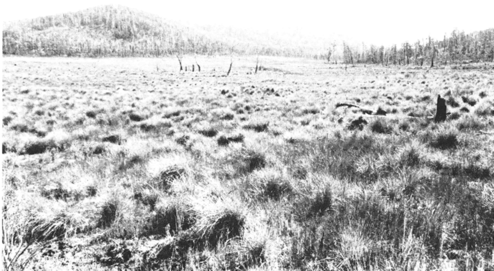
Drainage flats near Grey Mountain containing a black peat that supports a sedgeland/heathland dominated by Gymnoschoenus sphaerocephalus .