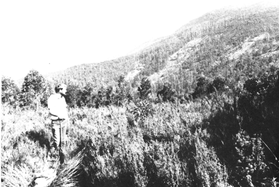
Sandstone bench at The Springs on Mt Wellington supporting heath and scrub dominated by Leptospermum scoparium and Eucalyptus johnstonii with the Organ Pipes (572352) Land System in the background.