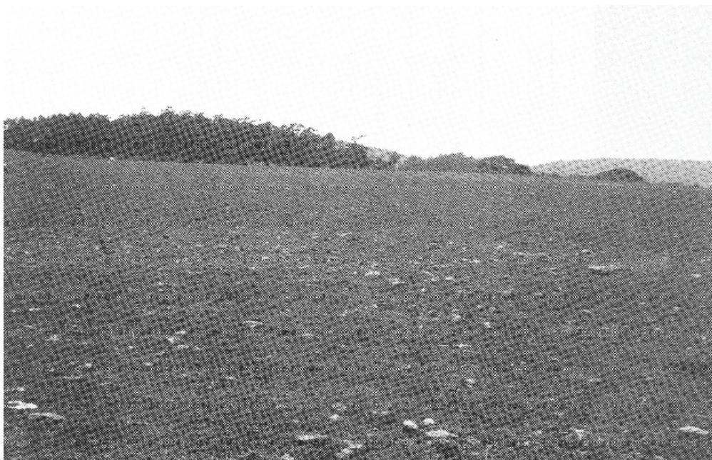
Rocky surface of the crests and upper slopes.

The principal hazards are sheet erosion, mass movement and waterlogging. Evidence of slumping can be seen on the steeper slopes throughout the system.