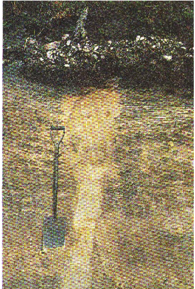
Typical profile in the scarp situation

Wind erosion represents a moderate hazard on the plateaux and severe soil erosion is likely on the scarps.