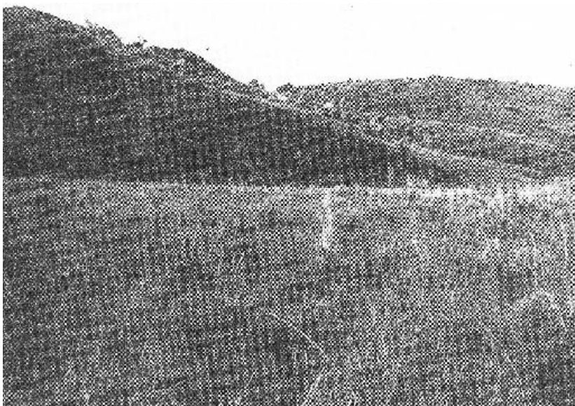
The flats belong to Strahan land system with Macquarie Harbour land system in the background